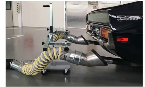
High temperature version available.