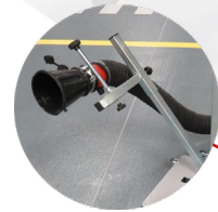
Fully adjustable arms.