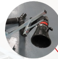
Rubber nozzle complete with clamp.