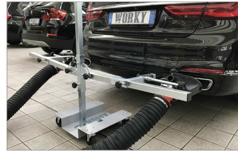
Twin exhaust extraction nozzles.